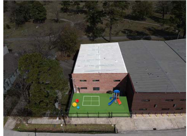
Rendered playground area. Currently used for parking.